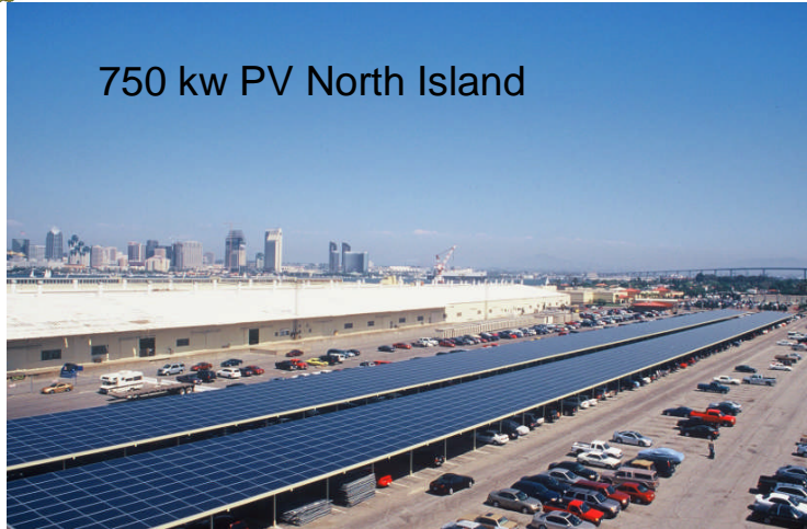
750 kw PV North Island