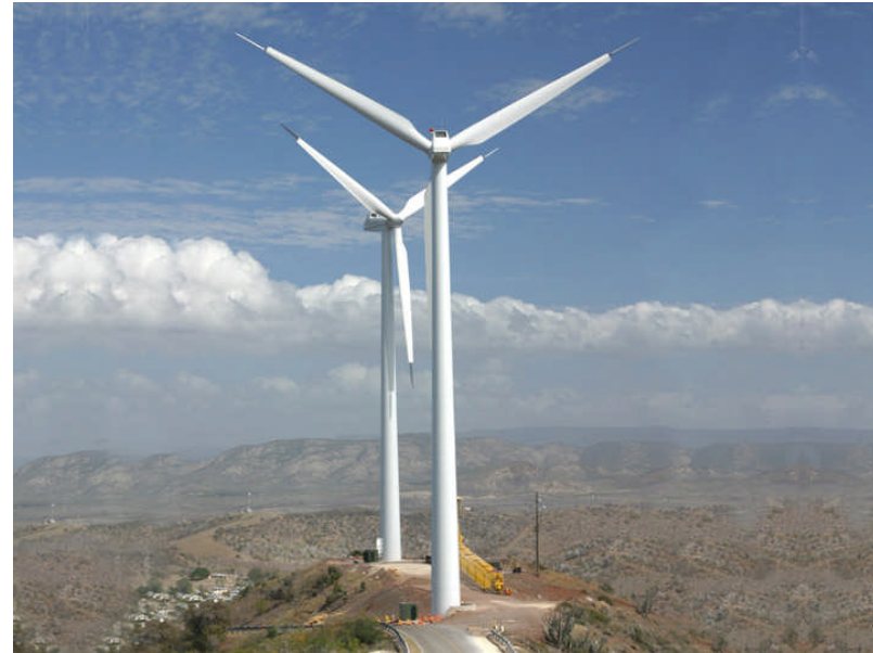
3.8 MW Wind ESPC project