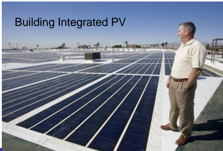
Building Integrated PV