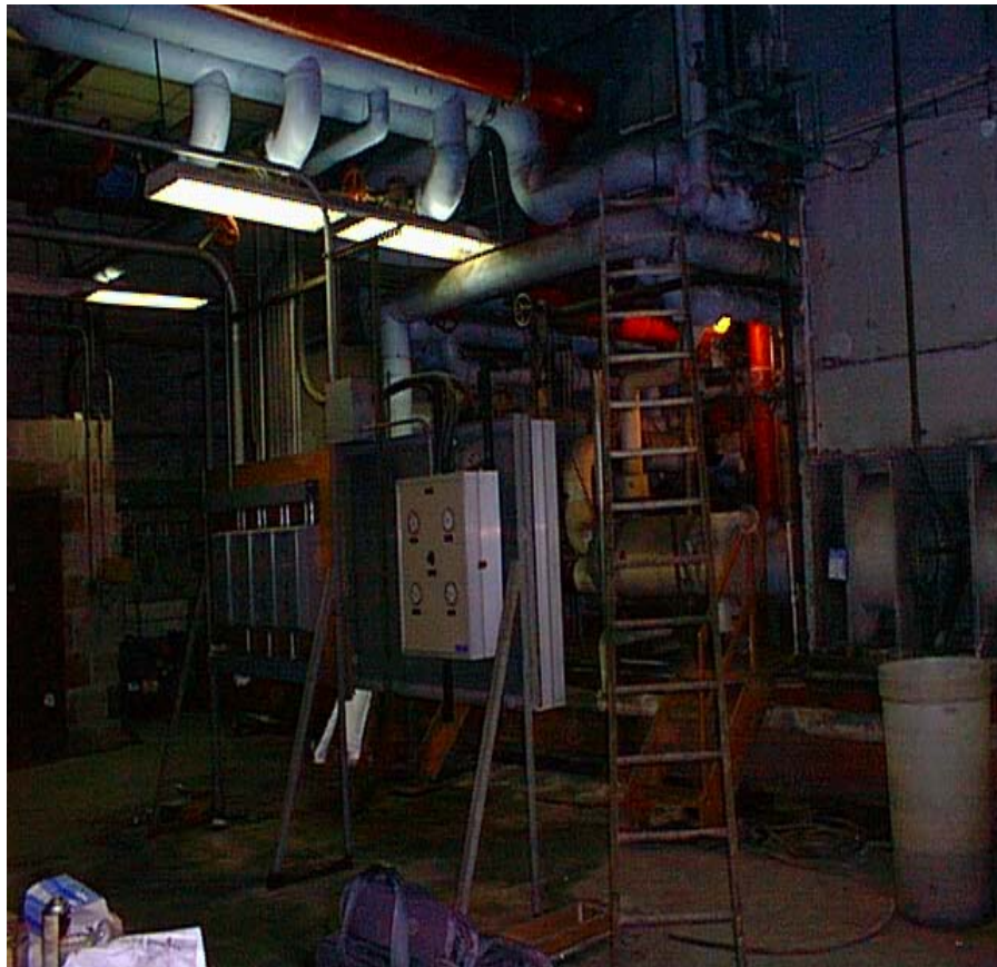
Cooling Tower - Before