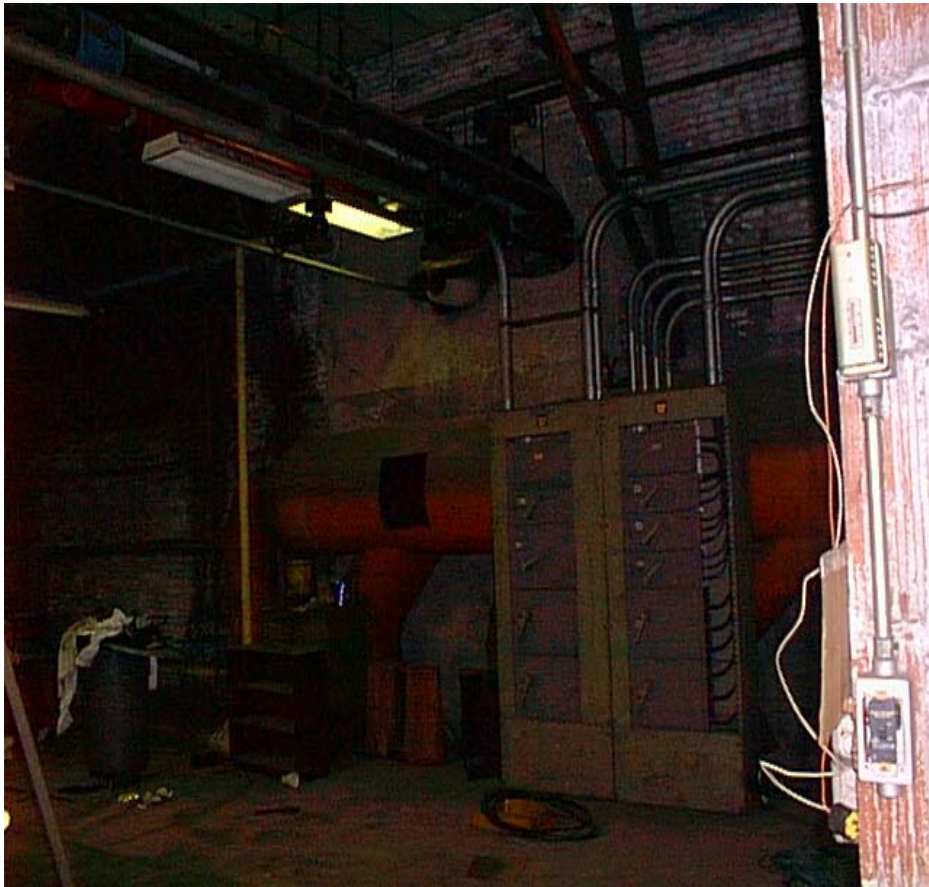
Cooling Tower Room - Before