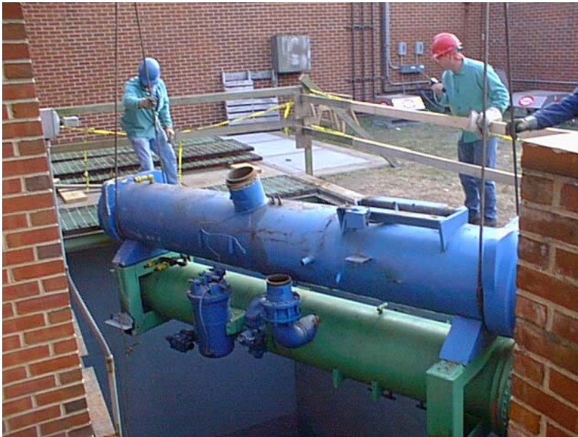
Removal of old Chiller