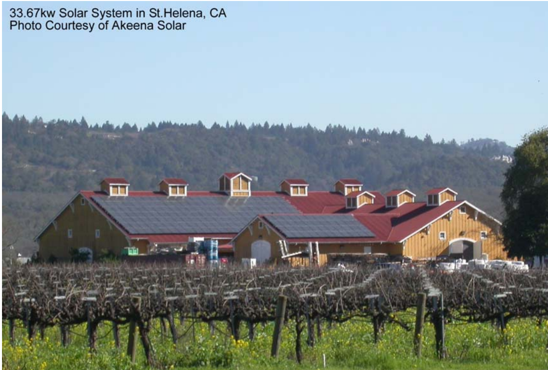
33.67kw Solar System in St.Helena, CA