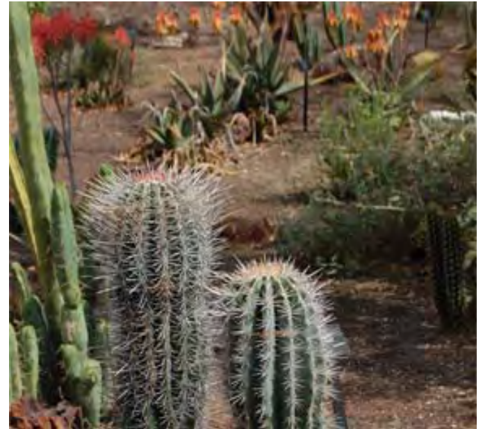
Pierce College's Botanic Garden contains both native and drought tolerant plants to reduce water dependency.

Cost Savings on Water and Environmental Benefit