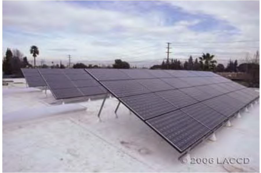
Los Angeles Valley Colleges Maintenance and Operations Building's rooftop PVC farm.