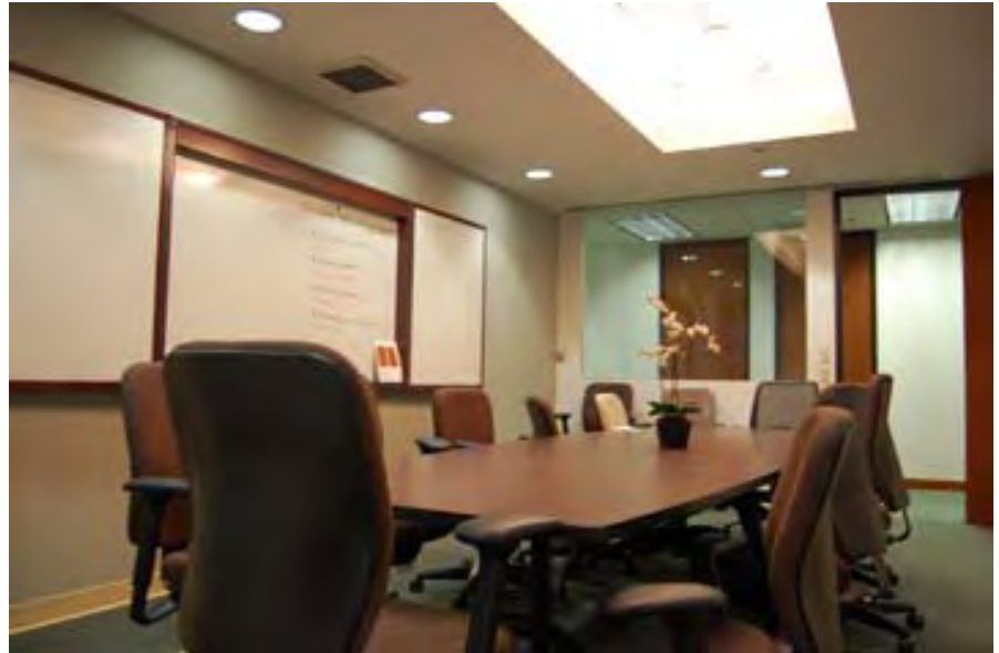
Conference room furniture available at LACCD's Furniture Procurement Showroom.