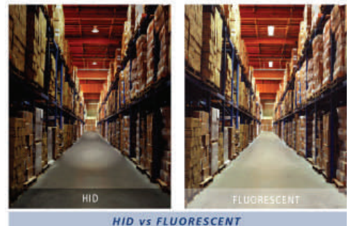
Illustration of lighting used in project